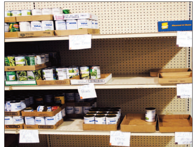
The shelves at Good Samaritan Resource Center's pantry have gotten thinned out due to a high volume of people in need.